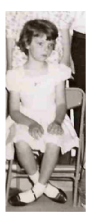
My kindergarten class picture (everyone else was looking at the camera!)

I didn't always know I wanted to be a writer but maybe I should have because when I was a kid my favorite hobby was daydreaming. Some of my teacher's appreciated the fact that I had a lot going on inside my head. But some didn't. They thought I should pay more attention in class! These days I'm lucky to have an editor who's glad I like to daydream.